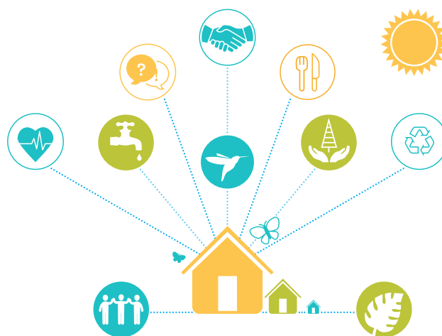
Figure 1. Adapted from The Meaning of Home (Movement Generation, 20XX year of publication)

Ecological Justice is the state of balance between human communities and healthy ecosystems based on thriving, mutually beneficial relationships and participatory self-governance. We see Ecological Justice as the key frame to capture our holistic vision of a better way forward.